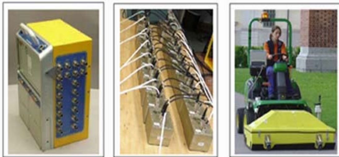
Left: Array option attached to a ProEx control unit. Middle: 1.3GHz Array antennas. Right: Vehicle mounted 400MHz array.

As opposed to other commonly marketed multi-channel systems, which in many cases could be regarded as parallel single channel systems, the MIRA system enables fast and true 3D data acquisition. From a user perspective this means that large areas can be mapped without loss of information and that the method is suitable for almost any kind of, shallow, subsurface investigation, i.e. targets with arbitrary shape, layers and linear objects are mapped equally well.