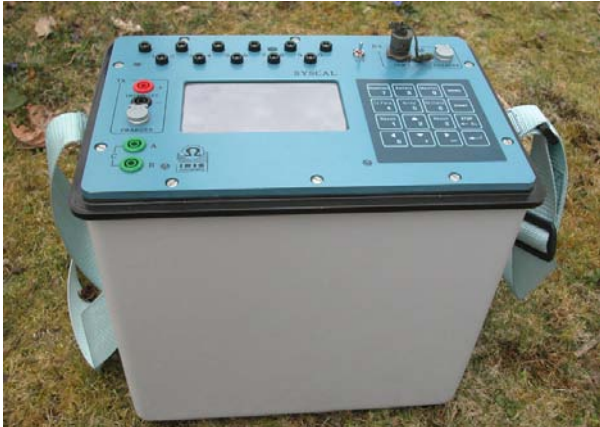
Syscal Pro Unit